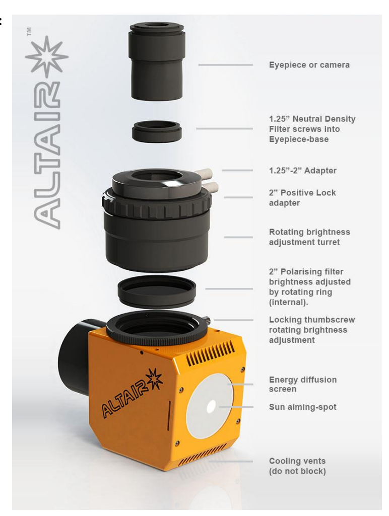
Fig. 1 PARTS DIAGRAM:

Introduction: The Altair Solar Wedge (Herschel Wedge) replaces the 2" star diagonal at the rear of your refractor telescope. The Solar Wedge transmits a greatly reduced, safe amount of light to the eyepiece or camera. This makes it safe for visual use with an eyepiece, or astrophotography with a high speed CMOS camera like Altair GPCAM or Hypercam. Solar wedges give higher-contrast images than front-mounted metallized solar film filters or glass solar filters, because there are no reflections between the filter and front telescope lens. The Altair Imaging-Ready Solar Wedge directs energy into a special extra thick Polycrystalline Ceramic diffuser disc at the back of the Wedge. The diffuser disc has the added benefit of acting like a "solar finder". The sun appears as a "ball of light" on the disc. Move your telescope until the ball of light is in the centre to align the telescope with the sun. It is important to familiarise yourself with the parts before use.